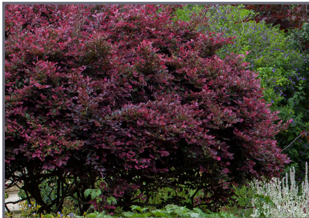
Chinese Fringe Flower Loropetalum chinense rubrum

Loropetalum chinense and cultivars (Chinese fringe flower), evergreen shrub, 8-12 feet tall and 6-8 feet wide, with small, oval to elliptical, olive green or reddish purple leaves on arching or horizontal branches and clusters of white to creamy white or pink flowers with frilly, narrow petals in spring. Native to forested slopes and open spaces from the mountains of northeastern India to China and Japan. Many cultivars, including compact plants 4-6 feet tall and 1- to 3-foot, mounding groundcovers. Sun to part shade, neutral to acidic, well-drained soils.