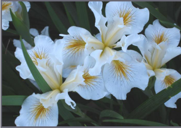
Canyon Snow Iris Iris 'Canyon Snow'

Iris 'Canyon Snow' (Canyon Snow Iris), perennial, 12-18 inches tall and 2-3 feet wide, with narrowly strap-shaped, glossy, dark green leaves and bright white flowers with golden yellow markings in early spring. Spreads slowly by rhizomes, forming large clumps over time. Hybrid between I. douglasiana and I. innominata , both native to coastal western Oregon and California. Cool sun to light shade, afternoon shade inland, well-drained soils.