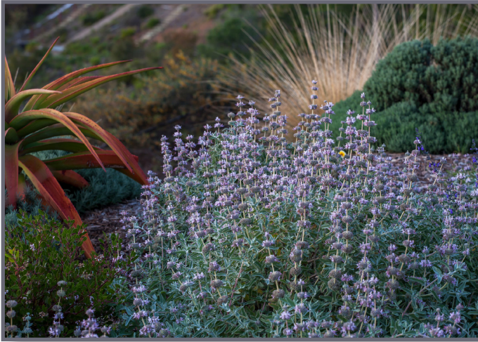
Purple Leaf Sage Salvia leucophylla 'Pt. Sal'

Salvia leucophylla 'Point Sal' (purple leaf sage), evergreen shrub, 1-3 feet tall and 8-10 feet wide, with aromatic, whitish gray, lance-shaped leaves, new growth green, and pinkish lavender, tubular flowers in spring and summer. Species is native to gravelly soils on hot, dry hillsides in coastal southern California and Baja California. Sun, fast drainage. Tip prune only. Sunset: 8-9,14-17,19-24