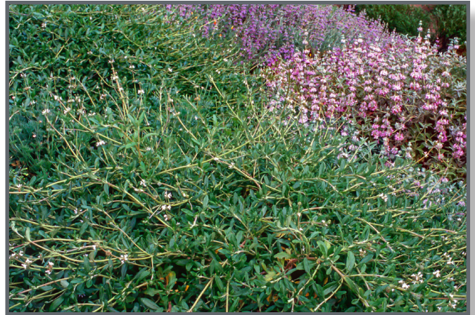
Bee's Bliss Sage Salvia 'Bee's Bliss'

Salvia 'Bee's Bliss' (Bee's Bliss sage), evergreen shrub, 1-2 feet tall and 6-8 feet wide, with lightly hairy, silvery gray-green, aromatic leaves and long spikes of lavender-blue flowers in mid-spring and early summer. Hybrid of garden origin, believed to be a cross between S. leucophylla and either S. clevelandii or S. sonomensis . May drop leaves in summer if grown dry. Sun to part shade, afternoon shade inland, fast drainage. Cut back in late fall to renew.