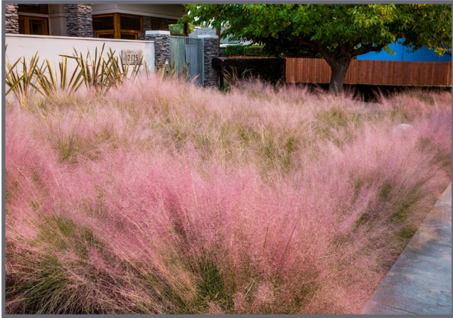
Hairy Awn Muhly Muhlenbergia 'Pink Flamingo'

Muhlenbergia 'Pink Flamingo' (hairy awn muhly), warm-season bunchgrass, 3-4 feet tall and 2-3 feet wide, with fine-textured, bluish gray-green leaves and tall plumes of pale pinkish gray flowers on 5-foot stems in fall. Flowers are followed by a haze of airy, purplish pink seedheads in late summer and fall. Natural hybrid discovered in Texas and believed to be between M. lindheimeri and M. capillaris . Sun to light shade, most well-drained soils, good air circulation.