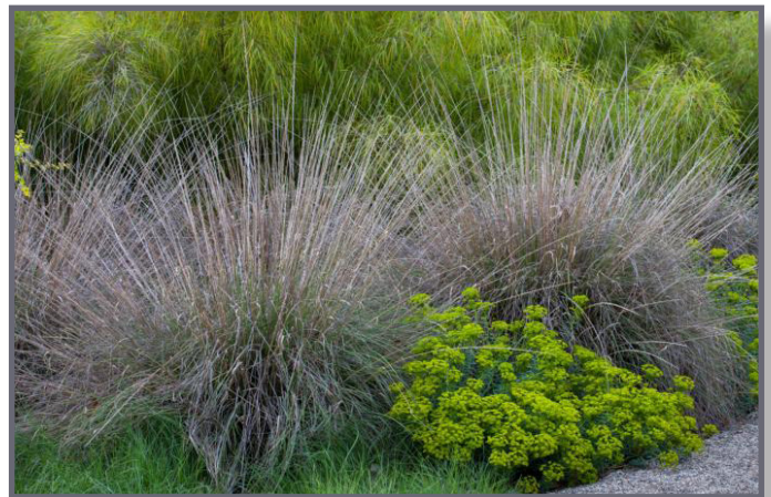
Lindheimer Muhly Muhlenbergia lindheimeri 'Autumn Glow'

Muhlenbergia lindheimeri 'Autumn Glow' (Lindheimer muhly) warm-season bunchgrass, upright to 3-4 feet tall and wide, with fine-textured, medium green to bluish gray leaves and 5- to 6-foot stems with pale yellow, late-summer flowers that age to tan. Self-sows but not aggressively. Species is native to Texas and northern Mexico and has creamy white flowers that age to silvery gray. Sun to light shade, most soils, good air circulation. Accepts periodic flooding.