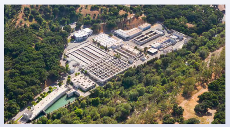
Built in 1965, each day the Tapia Water Reclamation Facility treats upward of nine million gallons to Title 22-Tertiary Treated Recycled Water standards.