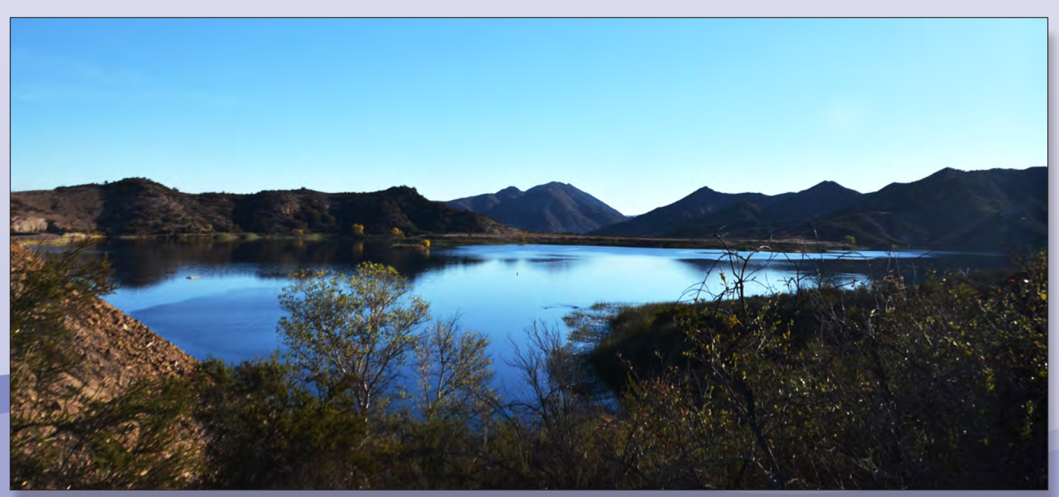
Las Virgenes Reservoir

necessary infrastructure to provide for the delivery of recycled water to a proposed advanced water treatment facility where proven technology will be used to purify the water. In addition to stopping the unsustainable practice of discharging recycled water to Malibu Creek in the winter, the Pure Water Project provides an affordable, local water supply that will be costcompetitive with imported water supplies over the long-term. This important effort will require public understanding, regional leadership, and funding to move from concept to reality.